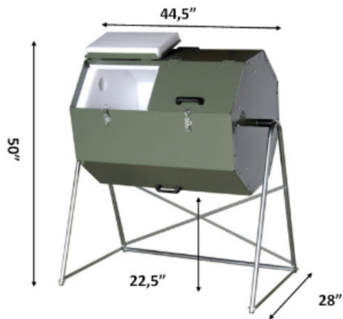
Joraform Compost Tumbler