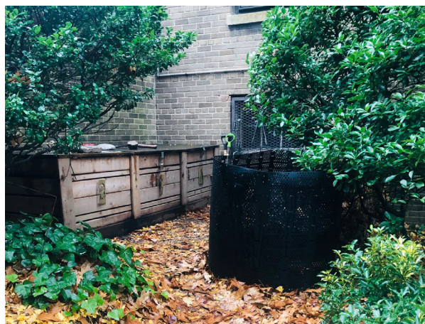
3-bin system with landscaping to obscure site and black Geobin used for leaves/browns or alternately for storing compost during curing stage