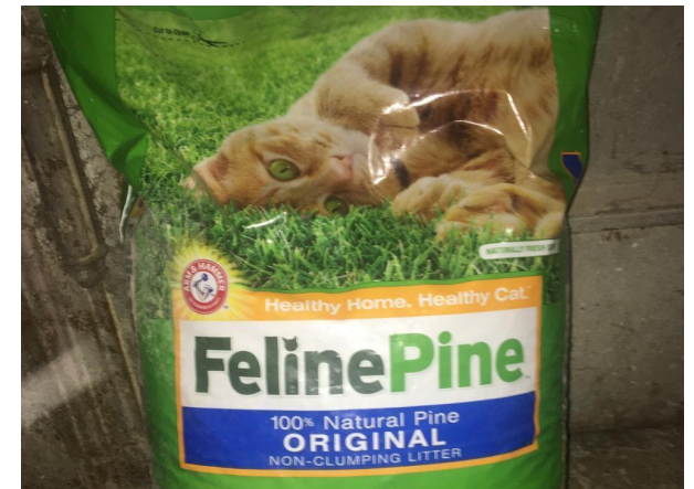
Arm & Hammer FelinePine 100% Natural Pine