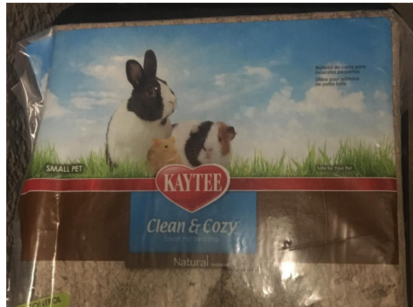
Kaytee Pet Brand wood shavings