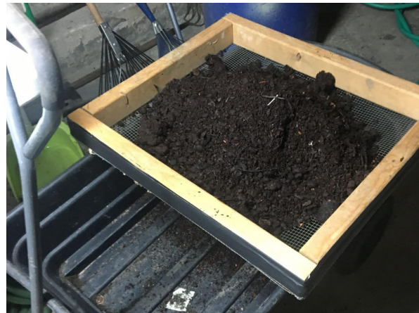
DIY sifting frame/screen for harvesting finished compost