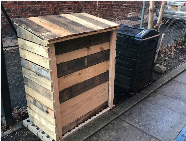
Commercially available Garden Gourmet plastic compost bin (right) and DIY wooden compost bin made from recycled shipping pallets (left).

Note: both compost bins sit on brick foundations.