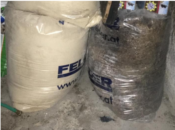
Sawdust is donated by carpentry shop affiliated with Hudson Scenic Studio; also shared with other coop compost sites