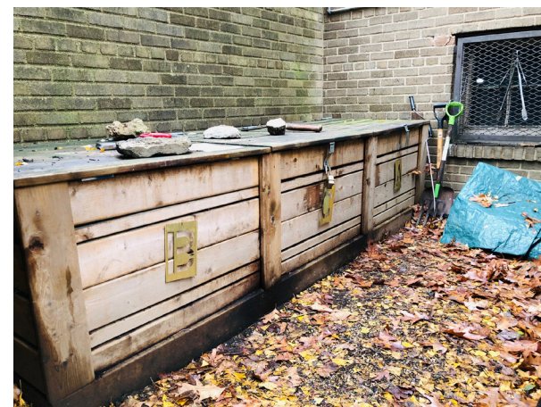
3-bin system next to building