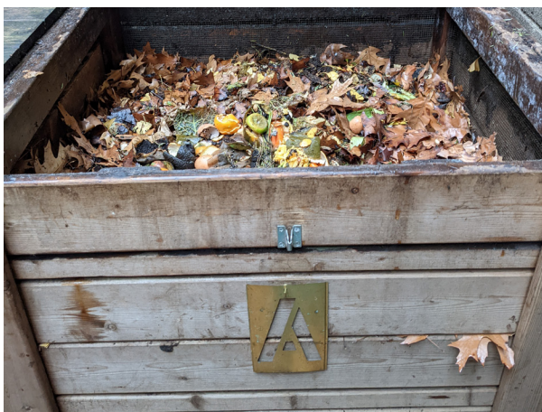
Active bin with “A” label