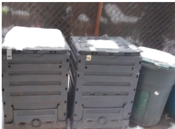
Eco Master Compost bins and browns bin