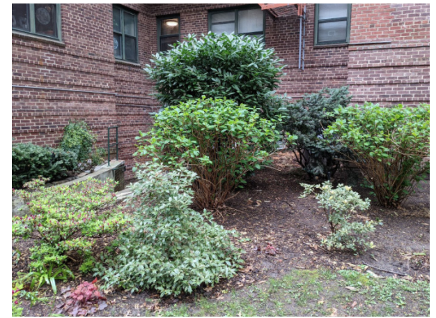
Compost bins hidden by landscaping