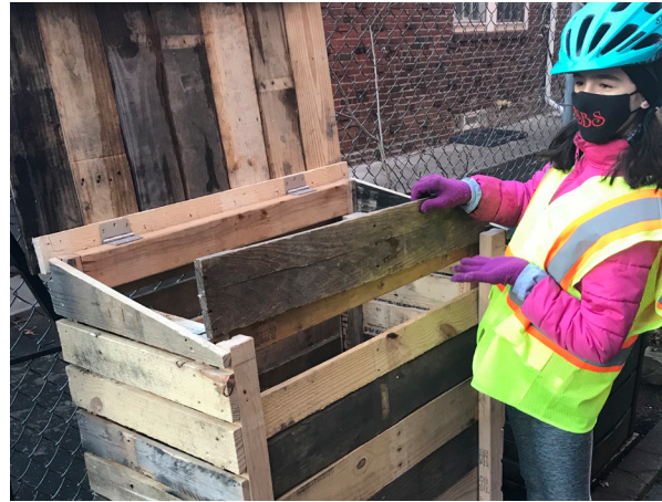
DIY compost bin has removable slats at face to allow gardeners to access compost for use in planting beds

Note: both compost bins sit on brick foundations.