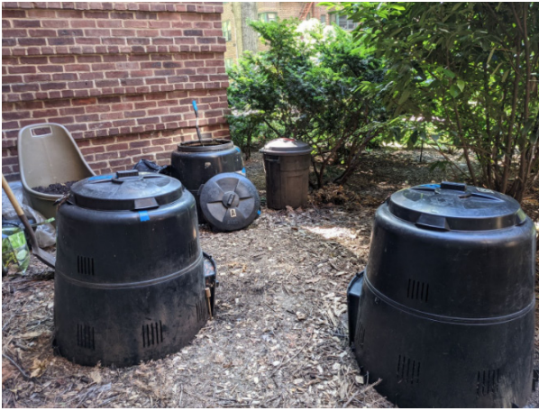
3 Earth Machine bins, browns bin and cart with finished compost