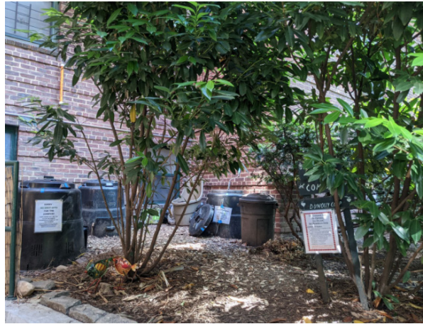
Location: by basement ramp, next to Management and Supers' offices with added landscaping to obscure site