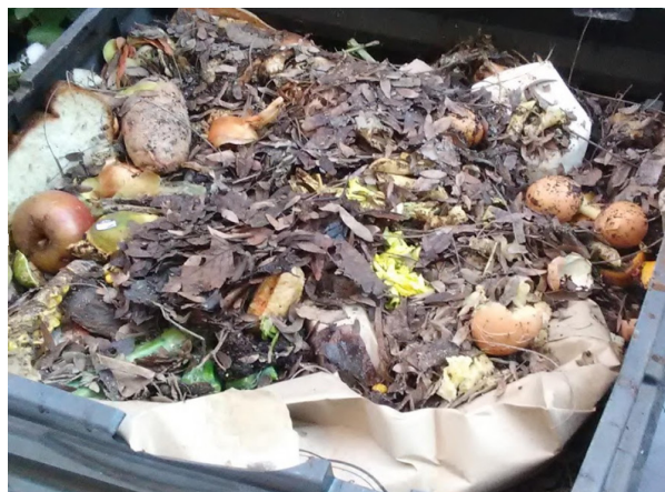
Active Compost Bin