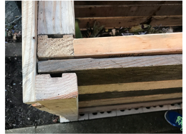
DIY compost bin detail (top-down view)